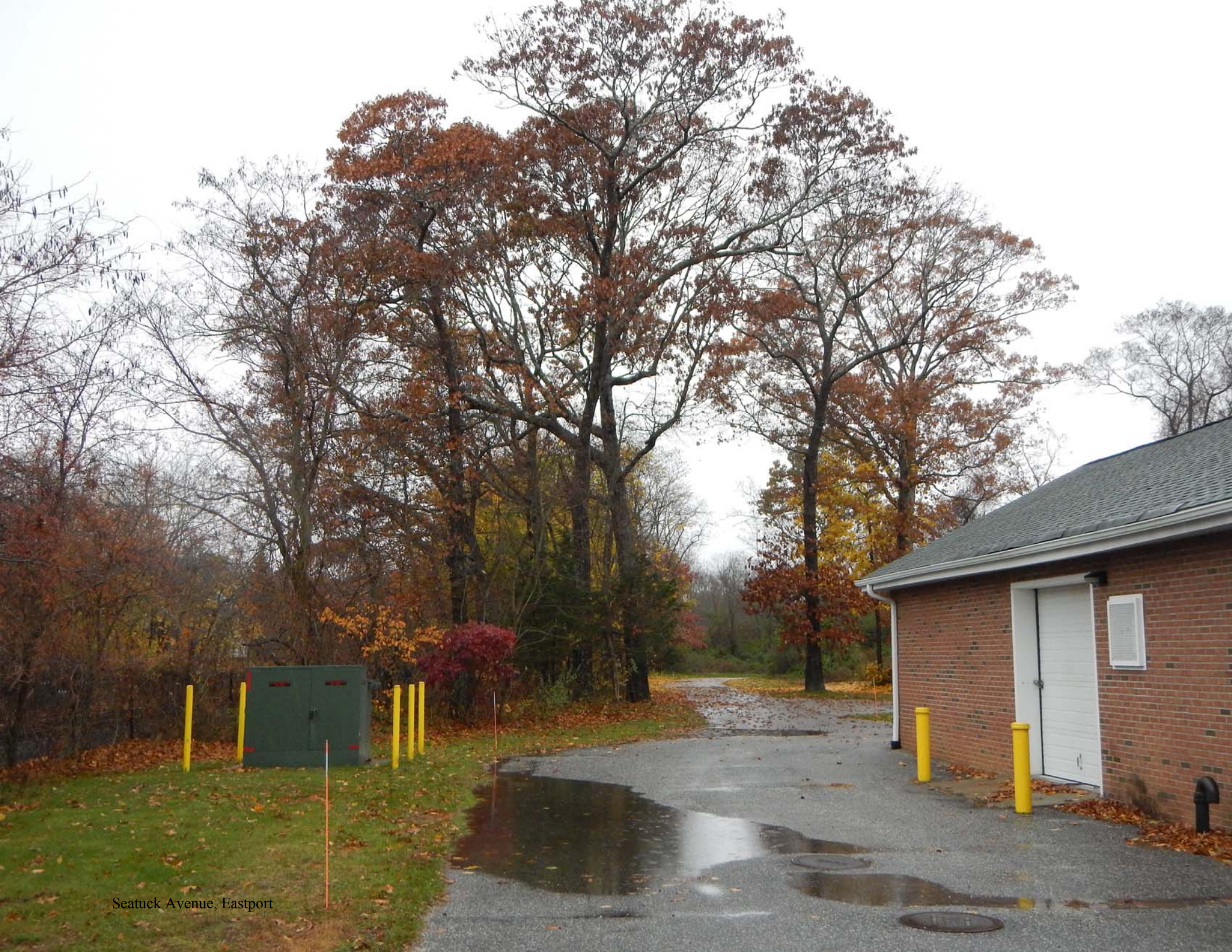
Seatuck Avenue, Eastport