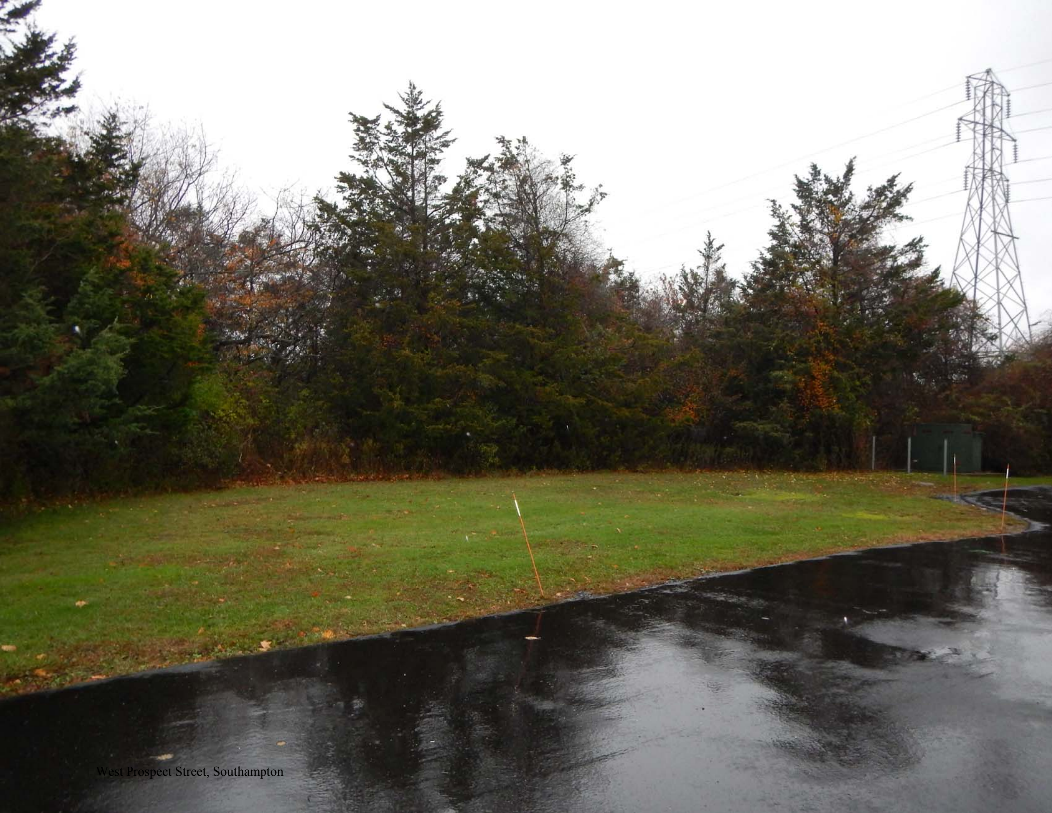
West Prospect Street, Southampton