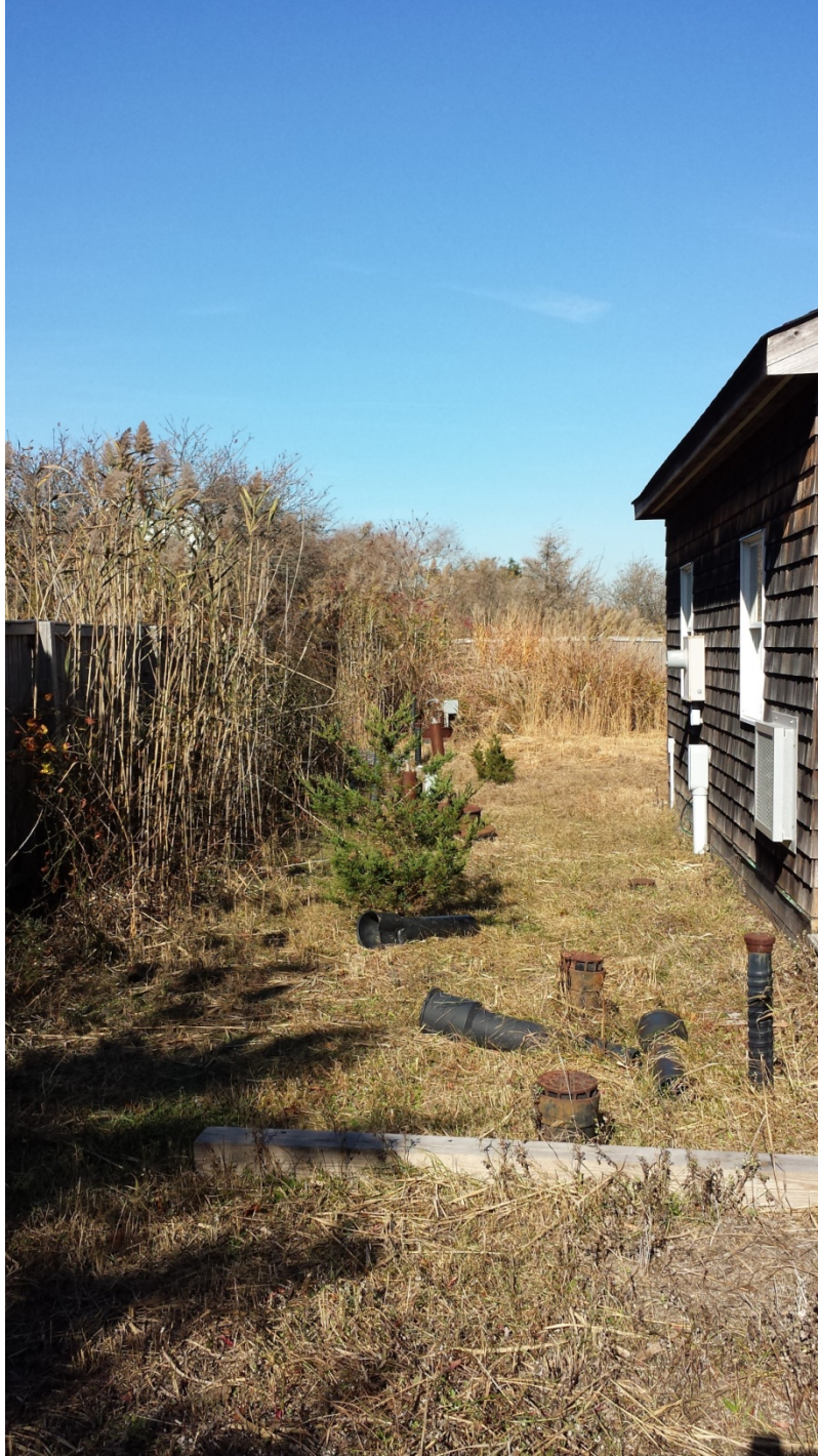
Sandy Walk, Dunewood