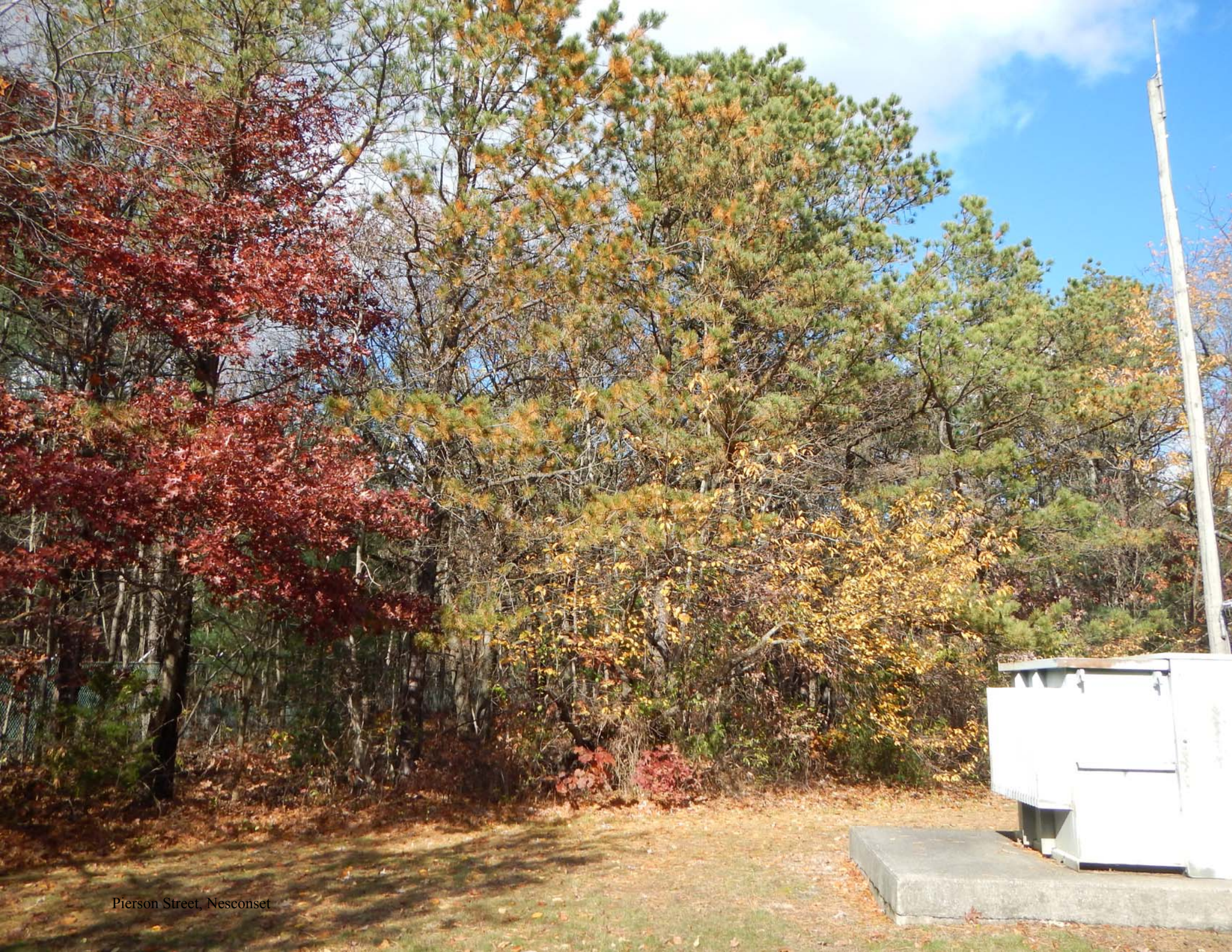
Pierson Street, Nesconset