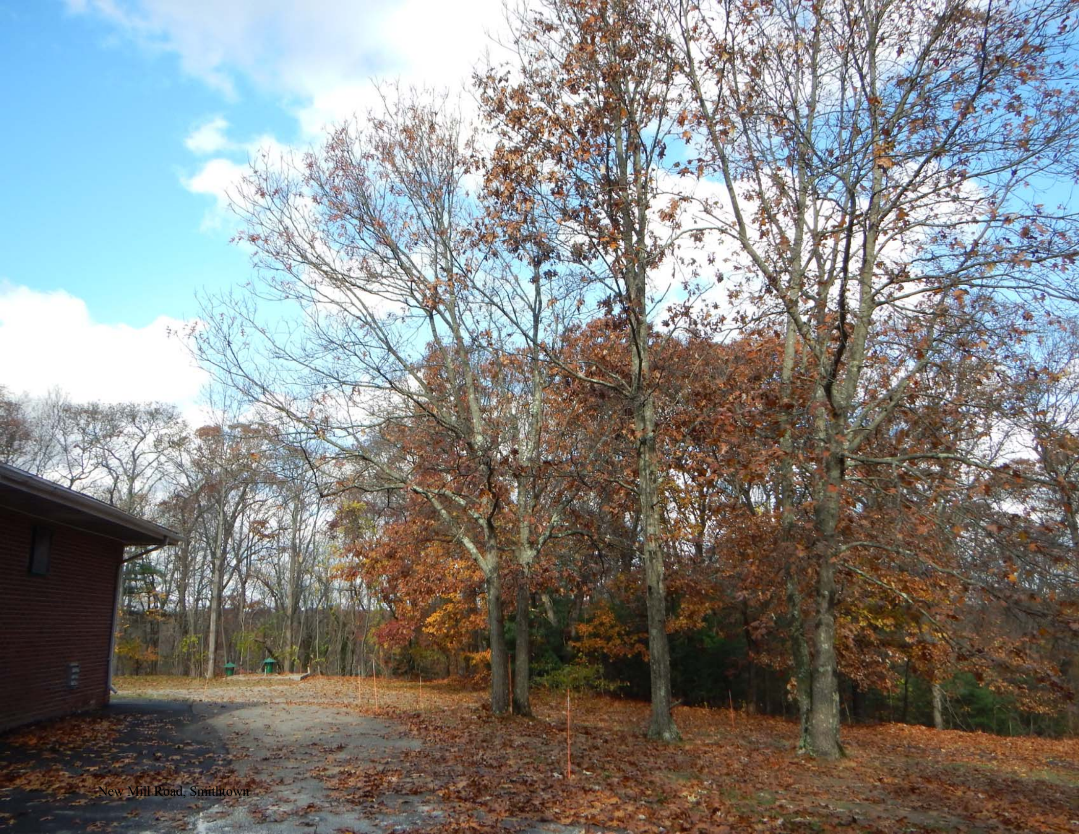
New Mill Road, Smithtown