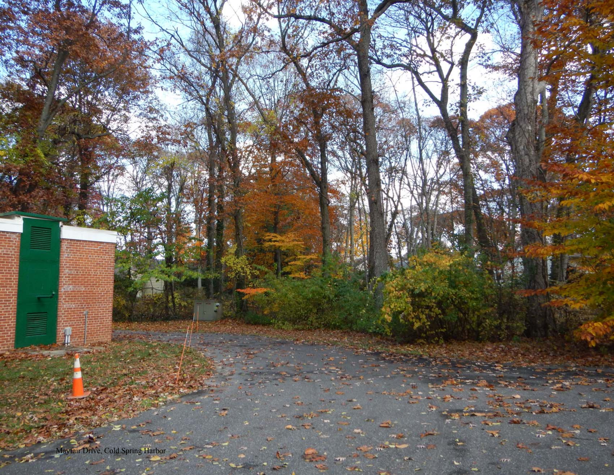
Mayfair Drive, Cold Spring Harbor